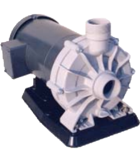
'PC' with cast iron pedestal. Also available with plasic pedestal.