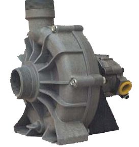
'PC' with hydraulic drive

'PC' SERIES AVAILABLE WITH VARIOUS DRIVES (pneumatic and gas engine drive not shown)