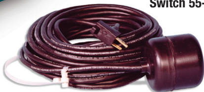
Optional Piggyback Float Switch 55-930

Slim-design, light weight CSA listed submersibles feature top discharge as well as cast-iron impellers, 304 stainless steel casing, motor housing, shaft and hardware. Pump motor is thermal overload protected. An optional piggyback mercury-free float switch is available. Float Switches: The mercury free liquid level control has a piggyback plug molded to the cord allowing the pump motor to plug into the cord and then plug the entire assembly into a standard grounded outlet.