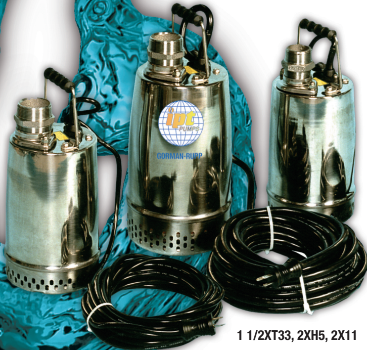
1 1/2XT33, 2XH5, 2X11