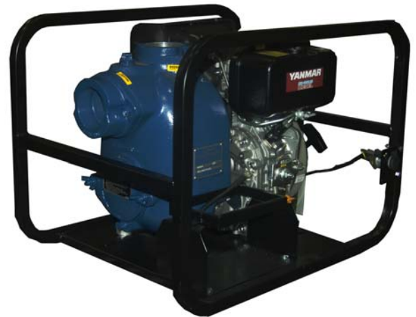
MODEL 13D-L70W FT4 SHOWN