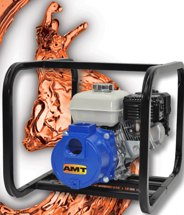
Model 316F-95 Dredging Pump